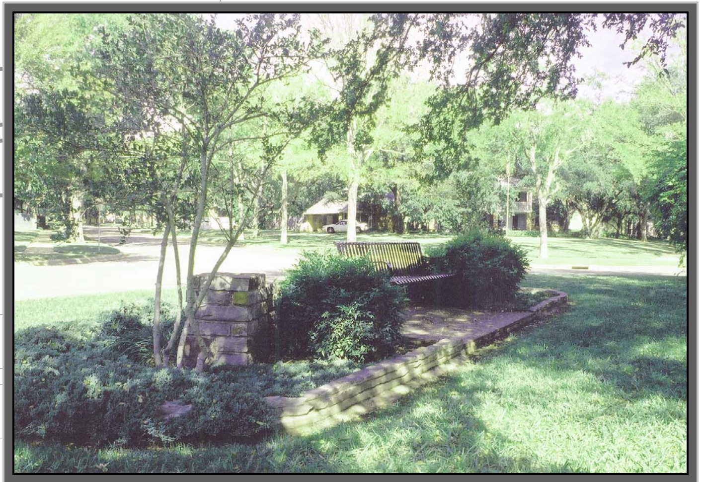
A Park Bench Located in a Commons