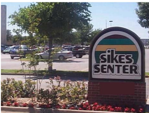
Figure 4.5: Sikes Senter is a Major Employer in Wichita Falls